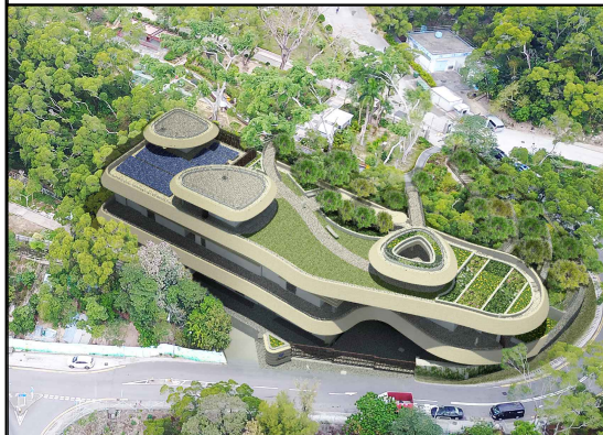
擬建於連接隧道入口的通風設施及其他相關機電設施 (構想圖) PROPOSED VENTILATION AND OTHER ASSOCIATED E&M FACILITIES AT ACCESS TUNNEL PORTAL AREA (PHOTOMONTAGE)